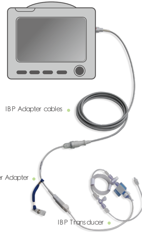
IBP Adapter cables